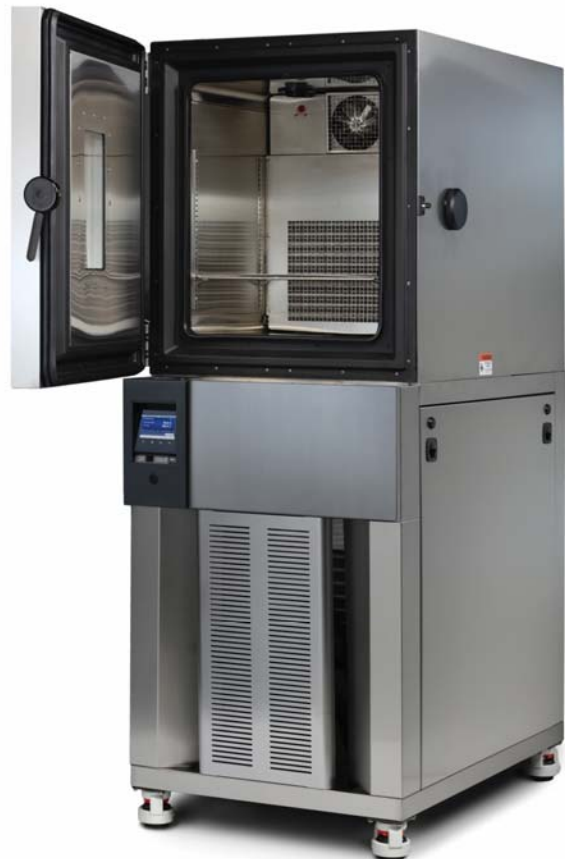
Shown with optional features: window, shelf, cable access port on right (instead of left)

The BTZ-4200 can save 15 minutes or more per cycle, compared to our BTZ-175 model.